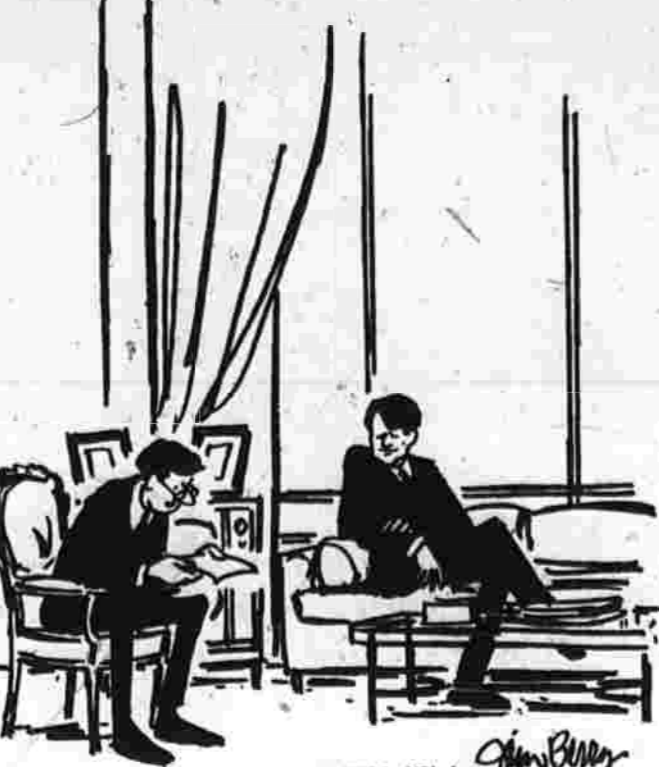
"Your biggest problem this year could be a 'charisma backslip!'"